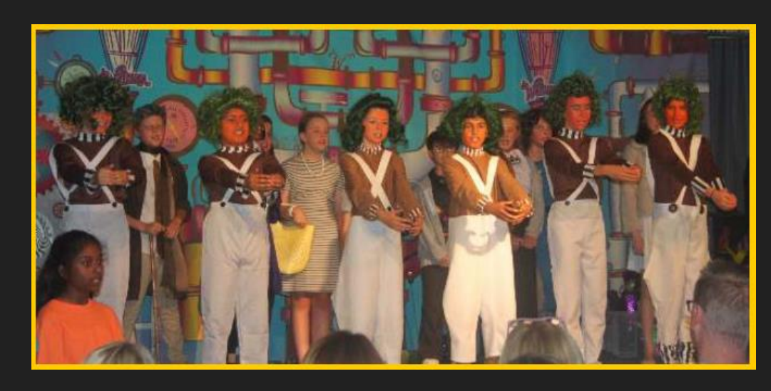
Charlie and the Chocolate Factory 2018